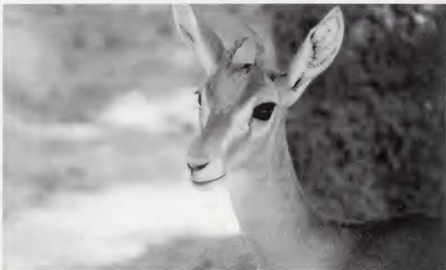
Fig. 2: Gazella rufifrons , female from Bandiagara.

The species lives in the isolated soft-sand-belt southeast of the Falaise de Bandiagara (Teli, 29 December 1993, no. 1465; Tireli, 12 February 1995, no. 1787). Up to now it was known only from the North of Mali (Musser & Carleton 1993). On the leeward side of the Falaise, sand from the northwind Harmattan falls down and forms a narrow band of soft-sand-dunes of 50–200 m in diameter close to the cliffs. This is the only suitable habitat for the sand-dwelling species in the area. Measurements (no. 1465 ♂, 1787 ♀): HB: 93, 90; T: 106, 110; HF: 24.3, 22.3; E: 13.8, 14.0; CB: –, 25.1.